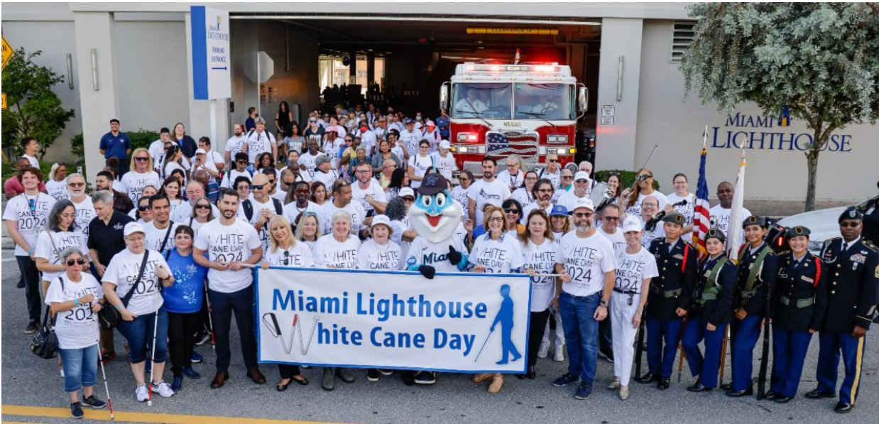
White Cane Day 2024

Miami Lighthouse celebrated the 60th Anniversary of White Cane Day on Tuesday, October 15th. Raising awareness about White Cane Safety Laws is the reason President Lyndon B. Johnson established the important legislation in 1964. The day is set aside to celebrate the many achievements of the blind and visually impaired and their important symbol of independence, the white cane.