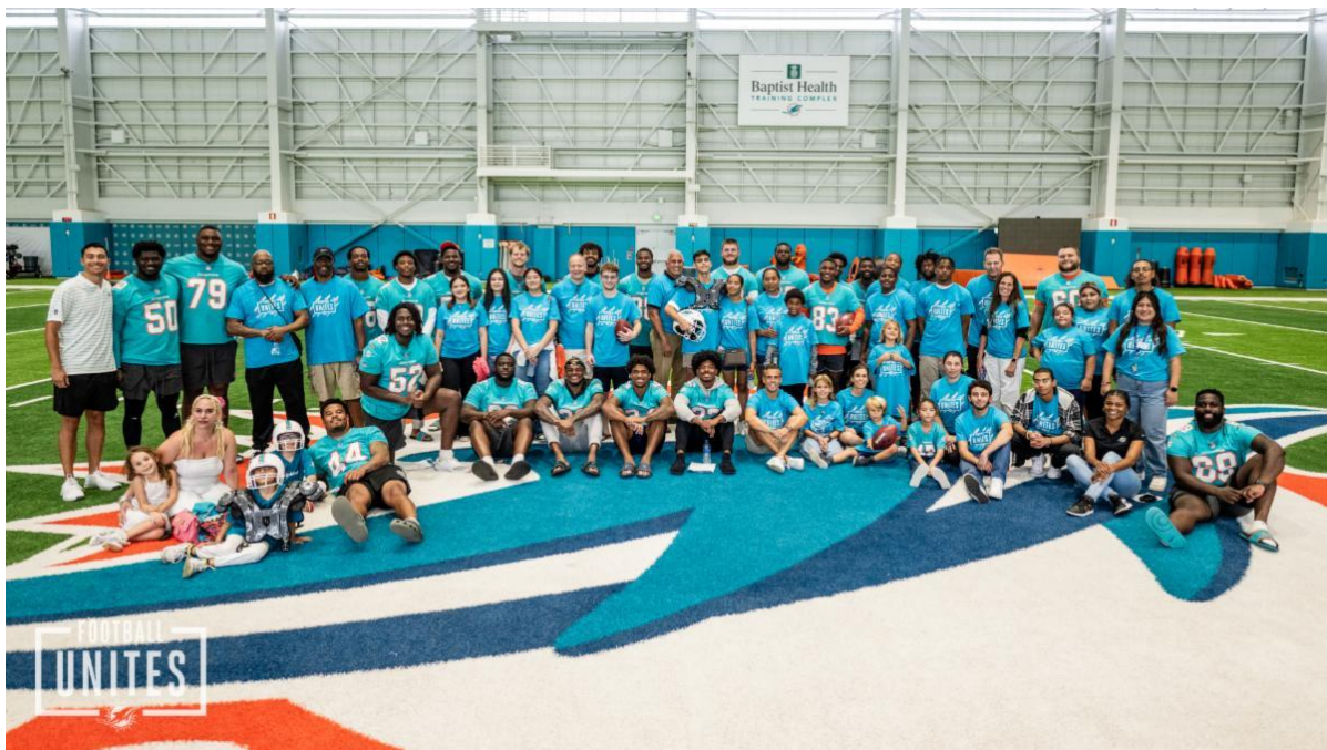
Miami Dolphins Rookie Class with Miami Lighthouse Families and Students