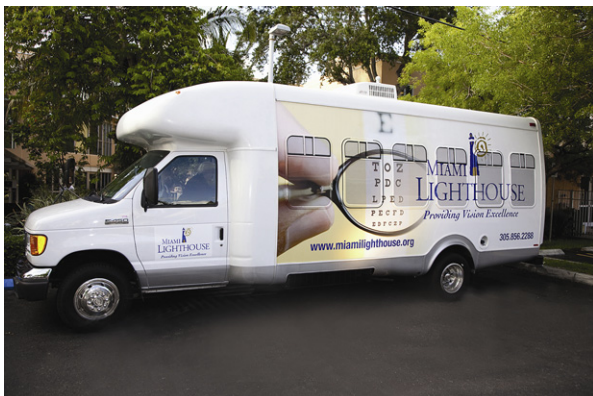
Figure 1 One of the Florida Heiken Children's Vision Program's mobile units.