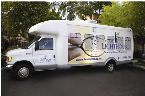
Figure 1 One of the Florida Heiken Children's Vision Program's mobile units.