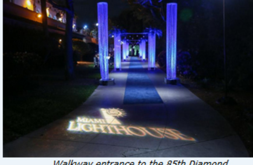
Walkway entrance to the 85th Diamond Anniversary Celebration

Entertainment was provided by Miami Lighthouse's nationally-recognized student and instructor musicians and vocalists.