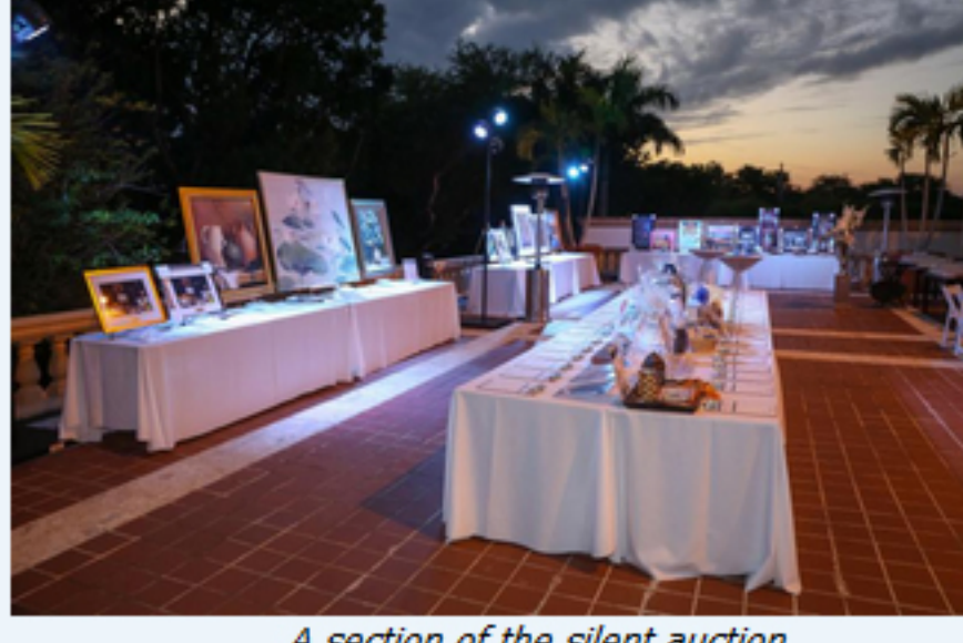
A section of the silent auction