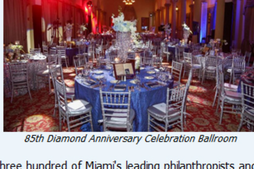
85th Diamond Anniversary Celebration Ballroom