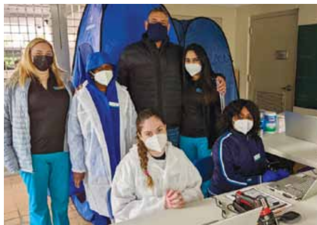
Accessible Home Healthcare of Aventura team