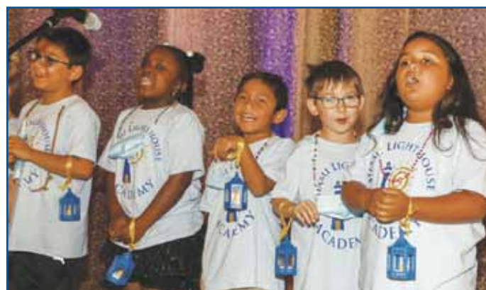
Miami Lighthouse Academy students

Miami Lighthouse announced a $1 million dollar challenge grant from a generous anonymous donor to encourage matching support for our CVI Collaborative Center. The CVI Collaborative is the first in the State of Florida between educators, medical professionals, researchers and service providers responding exclusively to Cortical Visual Impairment (CVI), the number one cause of pediatric visual impairment in the developed world. Our partners in this new initiative are pediatric ophthalmologists at Bascom Palmer Eye Institute, the nation's number one hospital in ophthalmology, neurologists at The Brain Institute at Nicklaus Children's Hospital, Nova Southeastern University School of Optometry and Miami-Dade County Public Schools.