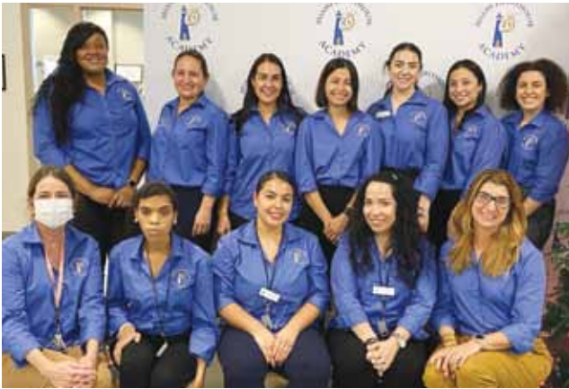
Teachers wearing new uniforms provided by the Rotary Club of Miami.

We express our appreciation to the Rotary Club of Miami and The Saul and Theresa Esman Foundation for their donations of apparel. Our teachers and students are delighted with their new uniforms and sweaters imprinted with our Miami Lighthouse Academy logo.