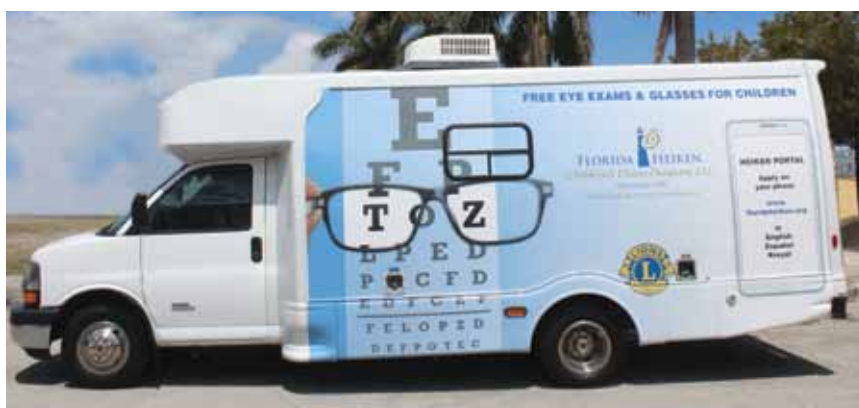
Lions Clubs International Foundation branded Heiken Program mobile eye care unit

We are proud to collaborate with Lions Clubs International Foundation and Johnson & Johnson Vision on the Sight for Kids program. Our Florida Heiken Children's Vision Program strives to close the gap in access to eye health care for children in low-income and underserved communities. Students across Miami-Dade, Broward, St. Lucie, and Palm Beach Counties will receive quality, comprehensive eye health services at no cost through our Heiken Program utilizing five mobile eye care units and a network of nearly 1,000 optometrists. Our goal is to reach 20,000 children across South Florida in our first year. These exams are being funded by Sight for Kids, a program co-founded by Lions Clubs International Foundation and Johnson & Johnson Vision, and we express our appreciation to them for partnering with our Heiken Program.