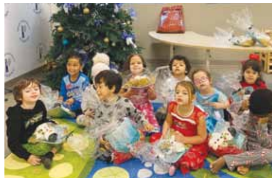
Early learners with gifts from the Esman Foundation