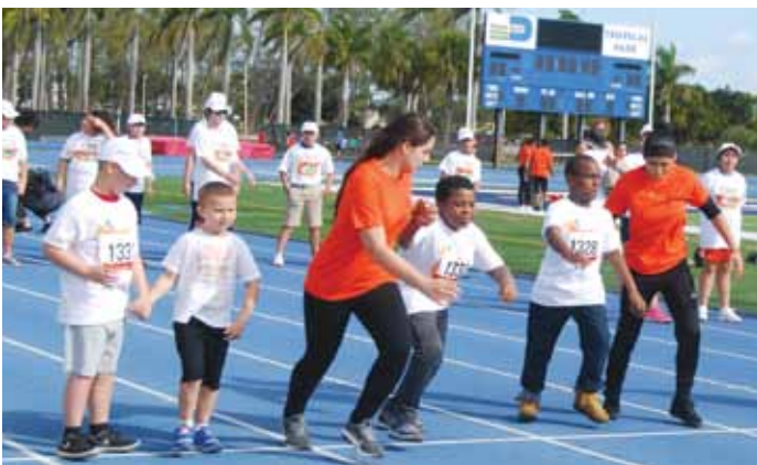
Students lined up and ready to compete at the Sports Ability Games