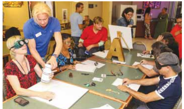
Several artists and event attendees participate in "Blind Time Drawing."