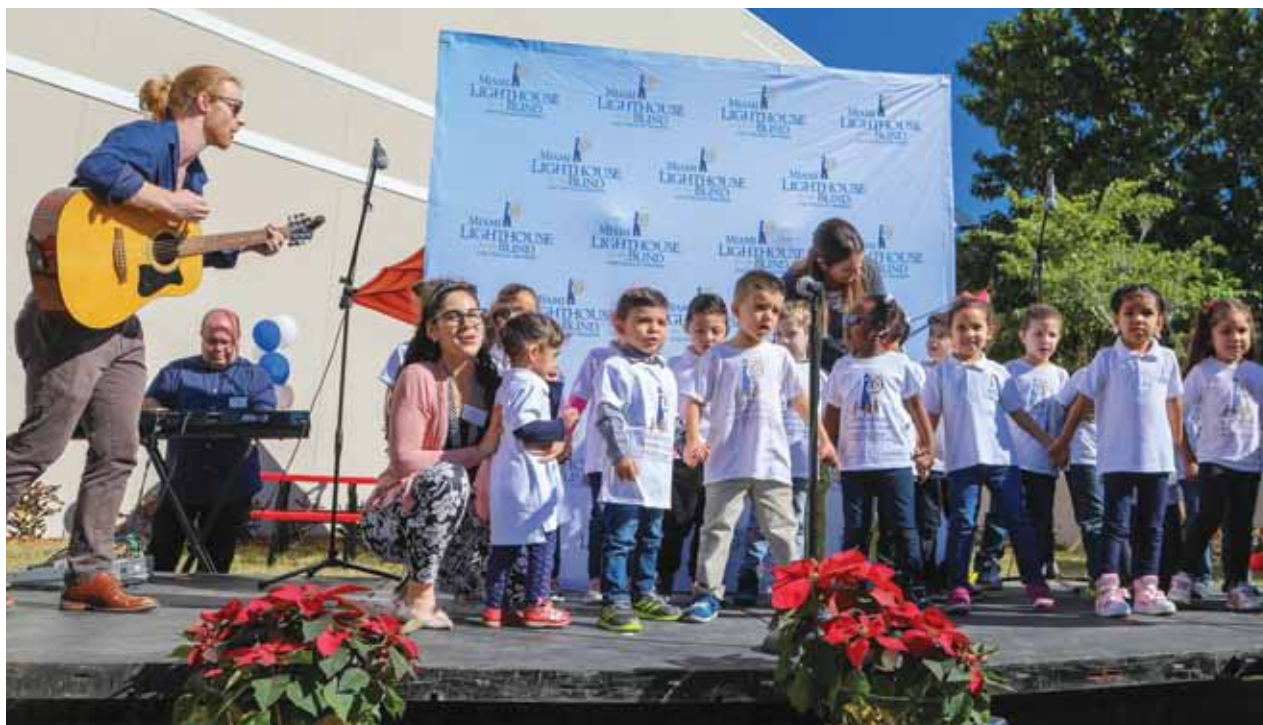
Pre-Kindergarten students perform at the ribbon cutting for our Charles J. and Olga Nielson Family Foundation Playground.

A highlight of the program was a song performance by our Lighthouse Learning Center for Children's pre-school students. Each preschooler received a Braille story book as a holiday gift donated by the Saul and Theresa Esman Foundation.