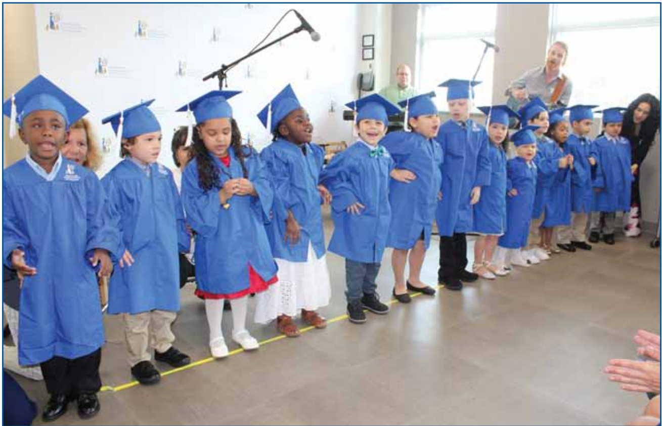
Lighthouse Learning Center for Children™ 2018 Pre-Kindergarten graduation

Our visually impaired early learners will have an opportunity to participate in our new Miami Lighthouse Learning Center for Children™ Kindergarten this coming fall semester. We express our appreciation to Miami-Dade County Public Schools and our entire donor community that has made this possible.