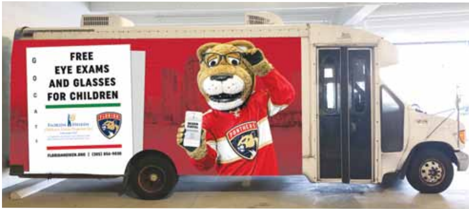
Florida Panthers Foundation new mobile eye unit

The Florida Panthers Foundation donated $25,000 to our Florida Heiken Children's Vision Program, pledging to provide financially disadvantaged school children who fail their vision screenings access to dilated eye exams and glasses when prescribed.