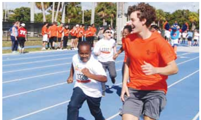
Racing to the finish line!