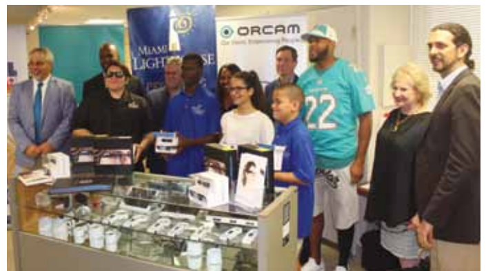
Representatives from the Miami Dolphins, Israeli Consulate and OrCam deliver OrCam wearable artificial intelligence devices to our students.