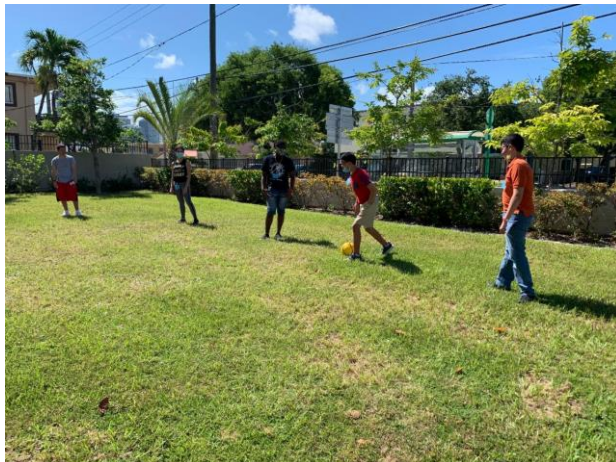
Soccer activity at Miami Lighthouse

Our summer camp recently switched to distance learning and our regular school calendar will follow Miami-Dade County Public Schools beginning remotely on Wednesday, August 31.