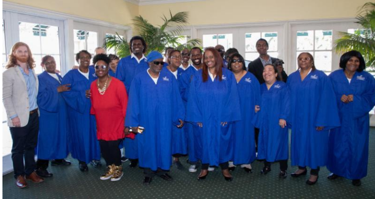
Miami Lighthouse United Voices Choir members

When twenty members of our Miami Lighthouse United Voices Choir performed recently at the Boca Boating & Beach Bash, in Boca Raton, their incredible gospel singing filled the hall with spontaneous applause. This is a relatively new group that is already making a name for itself in the community. When Miami Lighthouse students are invited to perform anywhere, they make a tremendous impact and leave a mark, especially on sighted attendees.