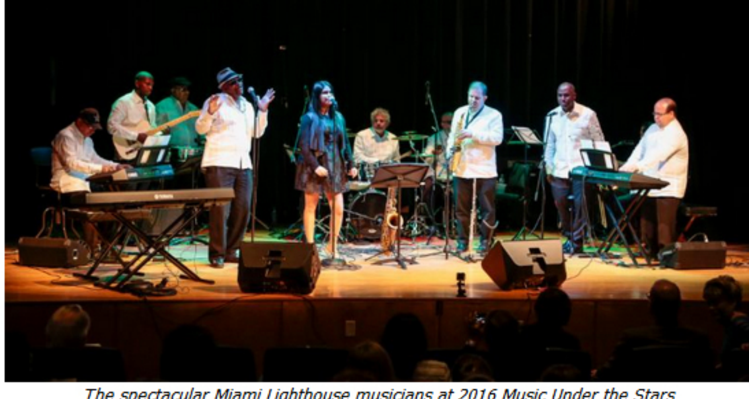
The spectacular Miami Lighthouse musicians at 2016 Music Under the Stars

Get ready for a night to remember! This year's exciting "Music Under The Stars" will be held at Brickell City Centre and will celebrate 25 years of providing free eye exams and prescription glasses for underserved schoolchildren. The evening promises to be filled with fine wine, great cuisine and special musical performances. Guests will enjoy a fabulous silent auction with getaways, spa packages, restaurant gift certificates, and much more. A raffle will be held to win gift certificates from Brickell City Centre shops. The annual event benefits our subsidiary the Florida Heiken Children's Vision Program.