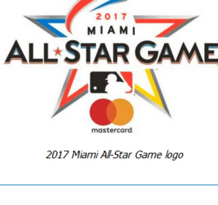
2017 Miami All-Star Game logo

Our Florida Heiken Children's Vision Program has been chosen by Major League Baseball and Miami Marlins as an All-Star Game Legacy Project. Legacy funding will go toward a new mobile optometric unit, replacing an outdated, 14-year-old vehicle that has been in constant need of repair. The new unit, which will be unveiled during the Miami All-Star Game in July, will allow us to expand our much needed services of free eye examinations with dilation and glasses for eligible schoolchildren. Design artwork on the new mobile unit will be made public on Wednesday, May 24th, from 6:00 to 8:30pm, at Music Under the Stars: Bon Appétit Brickell City Centre, a fundraiser for the Heiken Program.