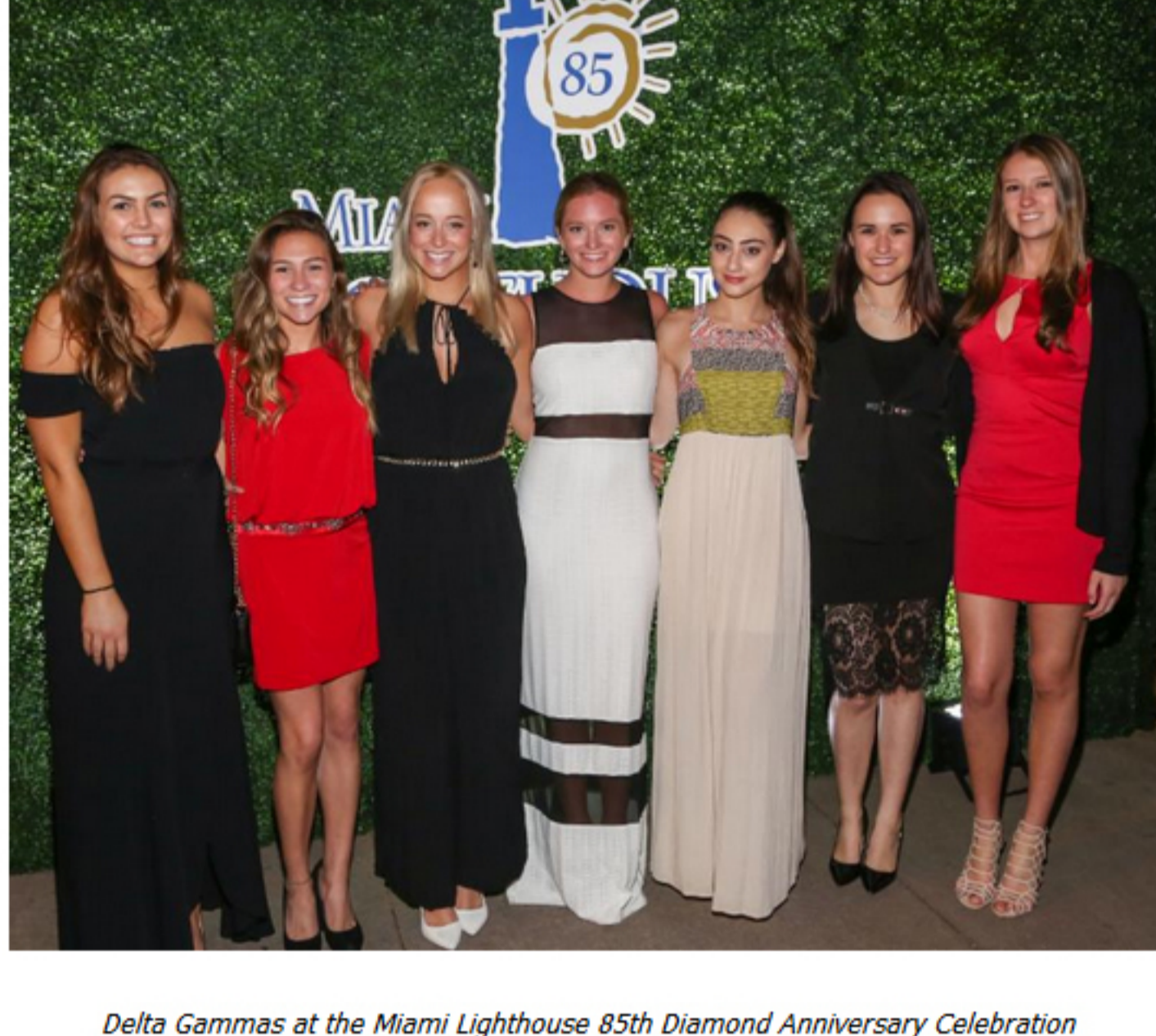
Delta Gammas at the Miami Lighthouse 85th Diamond Anniversary Celebration

Donations from the charity-minded sorority's annual Anchor Splash fundraiser were donated to Miami Lighthouse. The Delta Gammas are always ready and willing to help out at Miami Lighthouse. Most recently, they were beautiful additions to the welcome committee at our 85th Anniversary Gala at the Biltmore Hotel. Thanks, ladies. We think you're terrific!