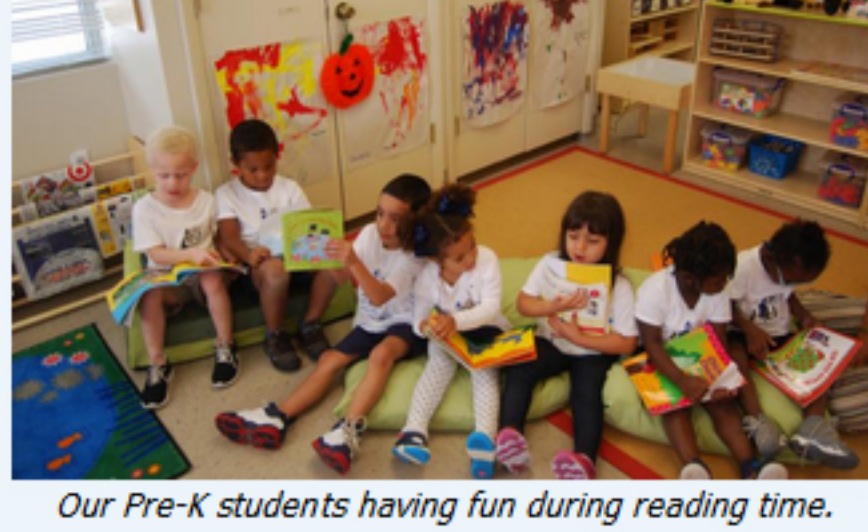
Our Pre-K students having fun during reading time.