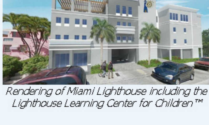
Rendering of Miami Lighthouse including the Lighthouse Learning Center for Children™

Thanks to our generous donors, licensed teachers have already been hired and a pilot curriculum, providing early learning for five blind children and five sighted siblings or peers, will take place this fall, even before the new building is completed!