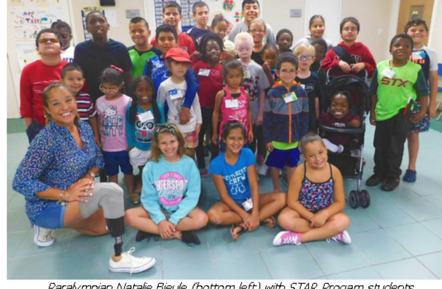
Paralympian Natalie Bieule (bottom left) with STAR Program students

A discus thrower with a prosthetic leg, the native Miamian had a big message for the students: "Never let anyone tell you no. The only limits are the ones we set for ourselves. No dream is ever too big!"