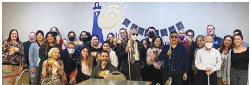
Miami Lighthouse Team

During Employee Appreciation Day, our staff were presented with a "self-care" gift card through the "Help the Helper Fund" made possible by The Miami Foundation, Allegany Franciscan Ministries, The Children's Trust of Miami-Dade County, Coral Gables Community Foundation, Frederick A. DeLuca Foundation, Health Foundation of South Florida, Jorge M. Perez Family Foundation, Key Biscayne Community Foundation, and United Way Miami.