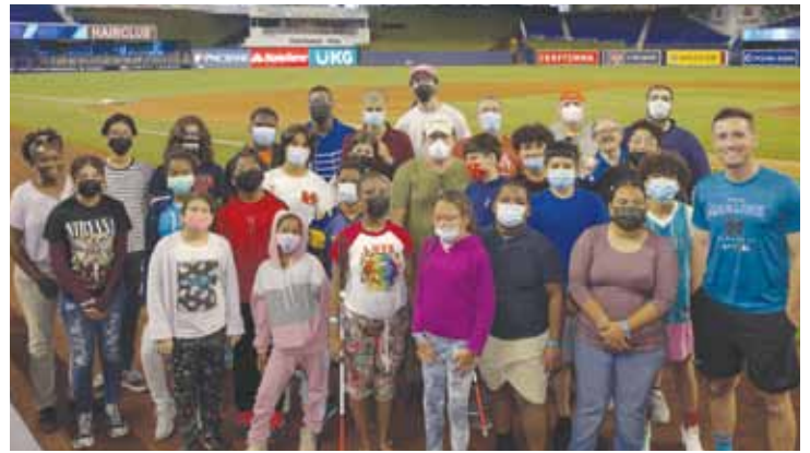
Miami Lighthouse Summer Camp Music Program students on the Miami Marlins infield with catcher Nick Fortes

Blind and visually impaired summer campers from our Music Program enjoyed a great day at the ballpark courtesy of the Miami Marlins. Our summer music students were led out onto the field of play just beyond the third base line where they met the manager of the field maintenance team and were invited to feel the outfield grass and the dirt surface of the infield. They visited the Marlin's dugout where they had the opportunity to hold various players' bats, major league baseballs, protective helmets, and gloves. Nick Fortes, catcher for the Miami Marlins, helped our students try on his face, head and chest protectors and autographed baseballs for our students. Following the tour, the campers enjoyed lunch and seating in a guest suite for the Marlins' noon game against the Pittsburgh Pirates. The Marlins won the game 5-4 in the 10th inning! We count on our corporate supporters like the Miami Marlins. You too can help by signing up through your employer for matching donations, by attending our events or by volunteering with us.