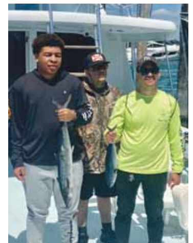
Miami Lighthouse teenagers enjoyed a deep-sea fishing excursion