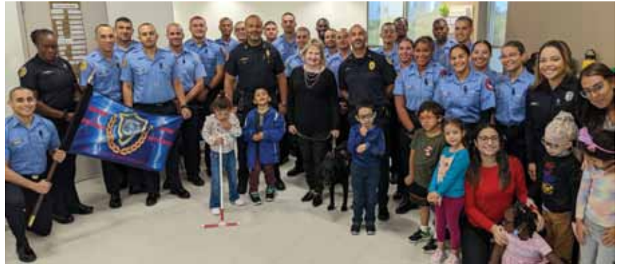
Cadets from the City of Miami Police Department visited our Miami Lighthouse Academy, Music Program and Senior Group Activities Program. We applaud the Police Department for keeping our city a safe place to live and work.