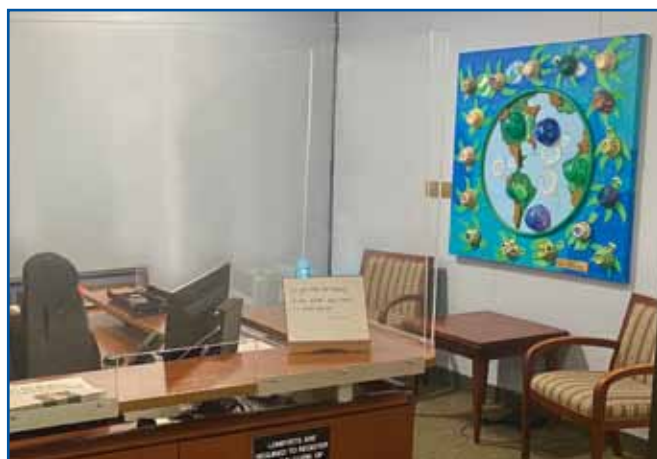
“Save the Earth and See Turtles”