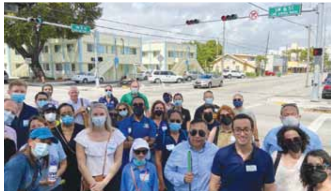
Safe Streets Summit attendees on the corner of SW 8th Avenue and SW 6th Street