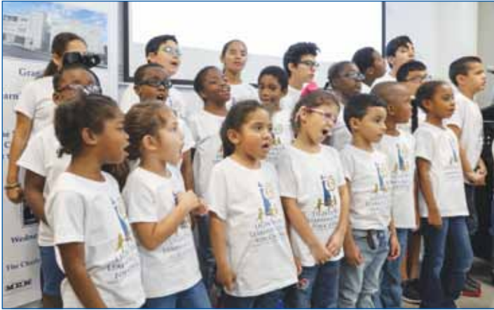
Children sing "Somewhere Over the Rainbow" at the Lighthouse Learning Center for Children™ Dedication Ceremony