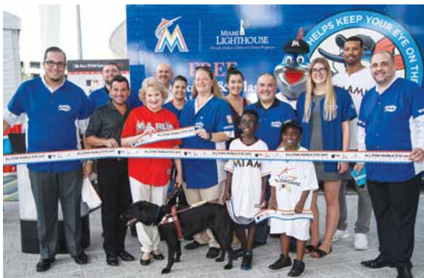
Ribbon cutting for new mobile eye care unit at Marlins Park