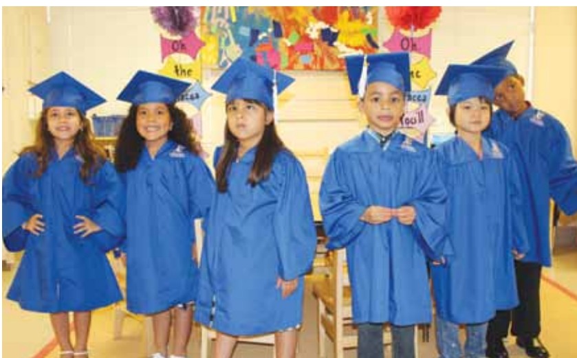
First graduates of our Lighthouse Learning Center for Children™ pre-kindergarten

Proud parents and teachers applauded as six visually impaired four-year olds with their sighted peers wearing caps and gowns paraded into the room to receive their Certificates of Achievement.