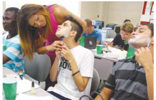
Pre-Employment Transition Program students get help from an Art of Shaving associate

Teenage boys in Miami Lighthouse's Pre-Employment Transition Program were visited by a group of shaving professionals from The Art of Shaving. The students were given individualized training on grooming where they learned and practiced several techniques that are used by professionals. Our teenage boys were thrilled to participate, and some even said it was their first time shaving. Afterwards, the students were each given a special Art of Shaving kit as a gift.