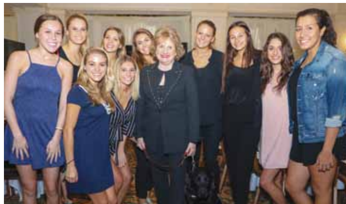
Delta Gamma-Beta Tau Chapter at the University of Miami