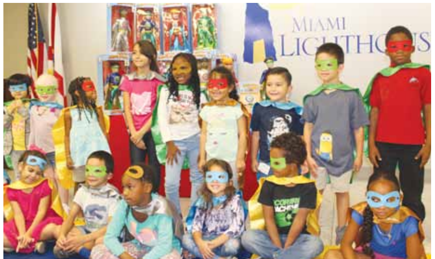
STAR Summer Campers pose with HeroBoys

a question and answer session and had the opportunity to wear their own capes and masks so they could create their own Hero with their very own "essence stone" (the key to the HeroBoys super powers).