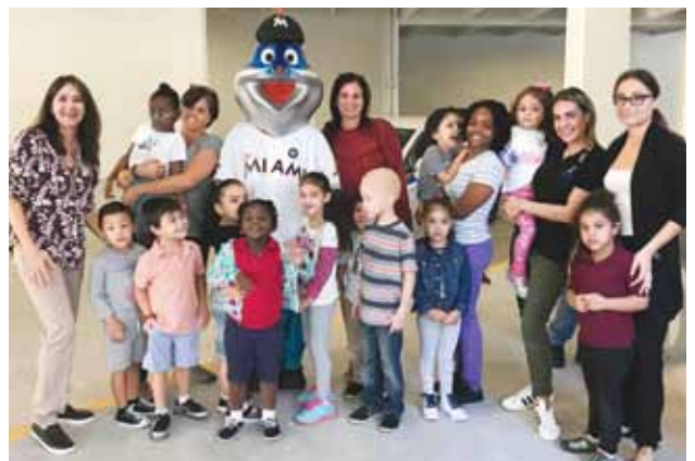
Pre-K students with Billy the Marlin at our White Cane Day event