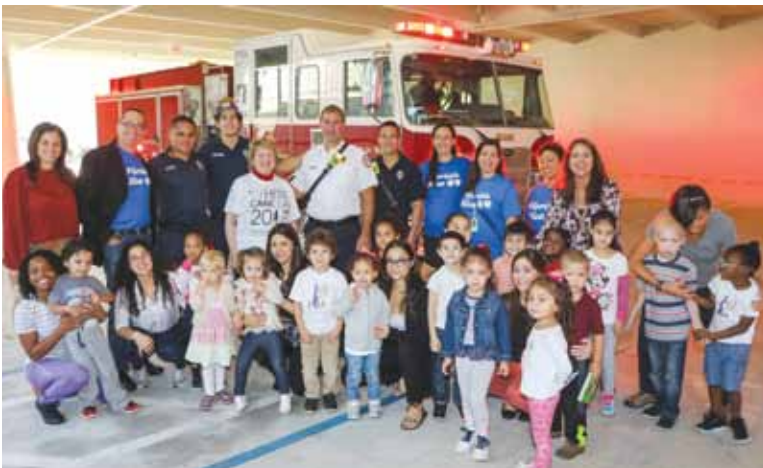
Pre-K students with City of Miami Firemen and Florida Blue representatives

We thank our participating sponsors, which included Florida Blue, MassMutual Miami, Lions for the Blind, Vanda Pharmaceuticals, Aira, OrCam Technologies, Walgreens Store #2544, Starbucks Store #8506 and Burger King Store #12778. Thank you to all of our supporters of White Cane Day benefiting programs provided by Miami Lighthouse.