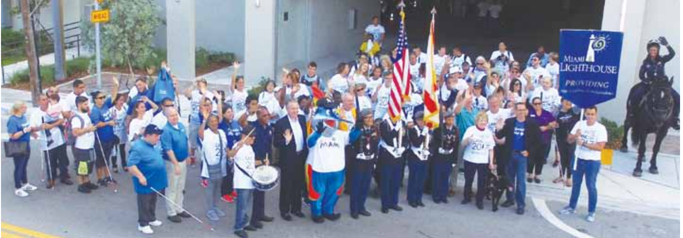
2017 Miami Lighthouse White Cane Day Celebration

Miami Lighthouse for the Blind celebrated over 85 years of service to the blind and visually impaired community on National White Cane Day in Miami on Monday, October 16th. Nearly 250 people of all ages, escorted by City of Miami Police and Fire Departments, walked from Miami Lighthouse, at 601 S.W. 8th Ave., around the block and back, where the celebration continued with food and music featuring Miami Lighthouse Music Program musicians.