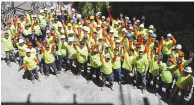
Bird's eye view of workers