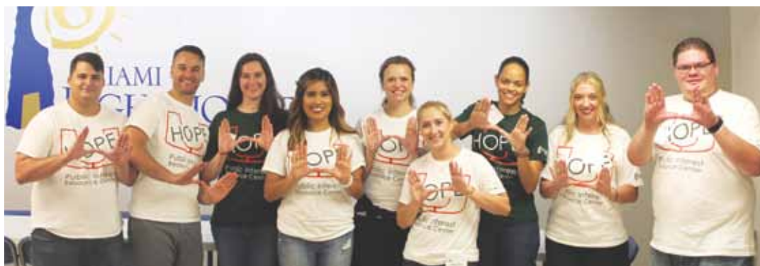
University of Miami Law School