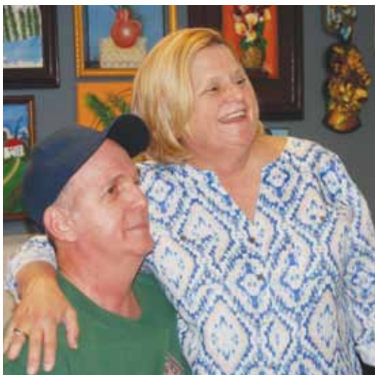
Congresswoman Ileana Ros-Lehtinen, co-chair of the Congressional Vision Caucus, toured Miami Lighthouse.