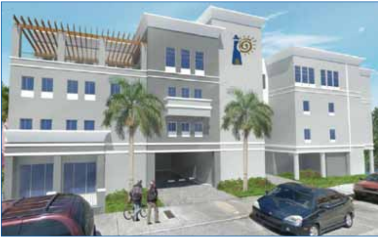
Architect's rendering of the 2017 Miami Lighthouse Campus

The groundbreaking ceremony for our new Lighthouse Learning Center for Children™ was held on August 3rd in collaboration with leading design and building professionals Wolfberg Alvarez & Partners and Munilla Construction Management. Elected officials, civic leaders and education professionals, as well as Miami Lighthouse Board Directors and other supporters were in attendance. The new facility has been made possible by private donations in response to a challenge grant from a local philanthropist.