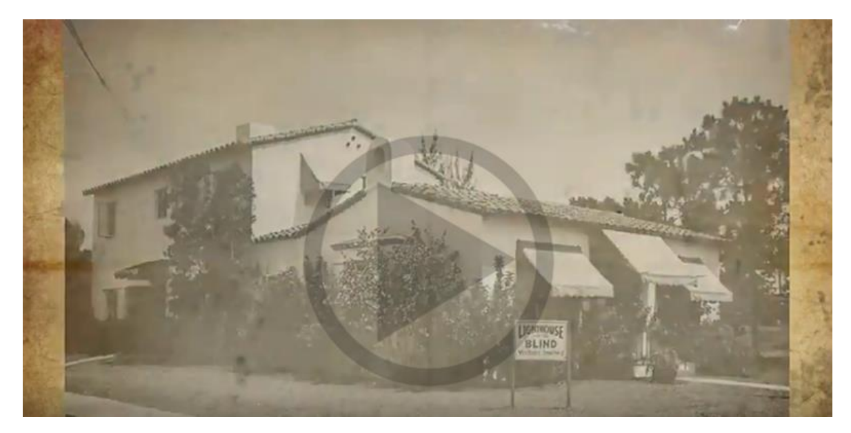
Miami Lighthouse 90 Years Salute Video

To fulfill our education mission, Miami Lighthouse partners with Florida International University on "Living With Low Vision" workshops for occupational therapists, physical therapists and nurses. To date, more than 100 occupational therapy students have completed their practicum experience and students from other universities throughout the U.S. have completed their Orientation and Mobility practicum training at Miami Lighthouse. Locally, Miami-Dade County Public Schools collaborates on a wide number of innovative programs headlined by our internationally recognized Lighthouse Learning Center for Children, and our nationally cited, highly regarded, Florida Heiken Children's Vision Program. Today we are Florida's largest and oldest nonprofit serving the needs and transforming the lives of nearly 90,000 blind and visually impaired people annually, from babies to seniors and their families.