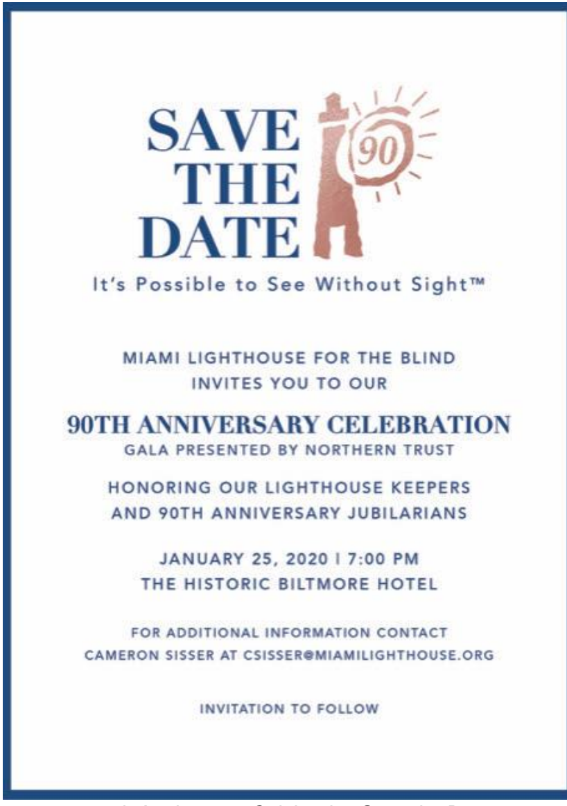
90th Anniversary Celebration Save the Date