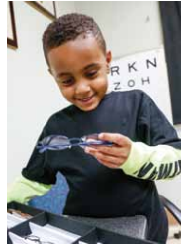
A student picking out frames