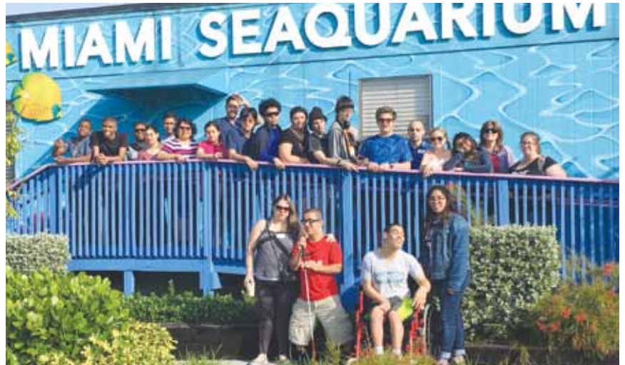
Pre-Employment Transition Program students' field trip to the Miami Seaquarium