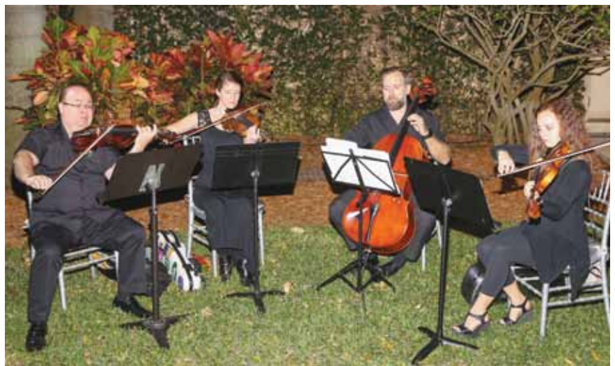
Miami Lighthouse String Quartet

Our youth music program, the Better Chance Music Program, held its annual winter concert at Miami Lighthouse. The group is currently preparing to perform in the #Speak Up, Speak Out, Send a Message Talent Showcase hosted by the Miami-Dade County Department of Parks and Recreation. Working in small performance groups, these young musicians continue to produce innovative and novel projects in both performance practice and sound engineering.