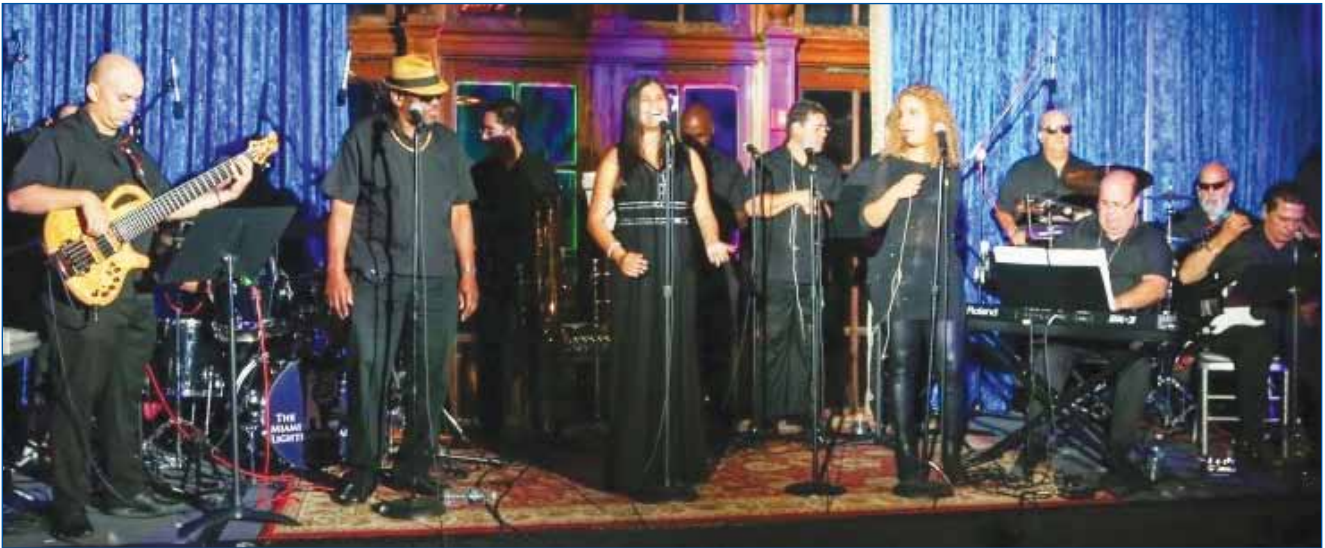
Miami Lighthouse Band performing at 85th Diamond Anniversary Gala