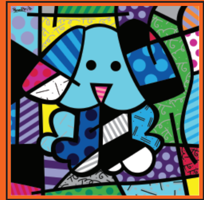
Romero Britto "Azul" ©2002