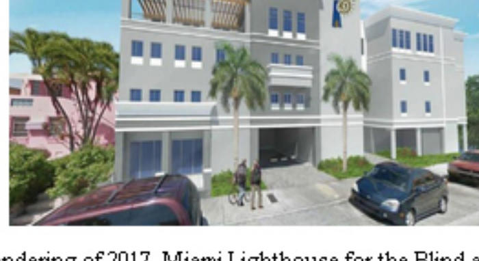
Rendering of 2017, Miami Lighthouse for the Blind and Visually Impaired