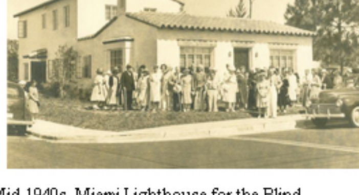
Mid-1940s, Miami Lighthouse for the Blind and Visually Impaired