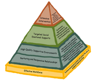
Upper right: Pyramid Model: Center for the Social Emotional Foundations for Early Learning

As part of this mission, the committee provided a four hour overview of the Pyramid Model at different locations throughout the community. Participants included early care and education teachers, directors and agencies' personnel. During the past 2 years, the Social Emotional Committee has provided the Overview of the Pyramid Model training to 795 members of our Early Childhood and Education Community in Miami-Dade County during our Social Emotional Development Awareness (SEDA) events. This group is on an exciting path to building a more responsive community around young children's social and emotional competence. This interagency collaborative is comprised of members from the Early Learning Coalition, Miami-Dade County Child Development Services, Community Action Agency Head Start, Citrus Health Network, Family Central, United Way, FDLRS-South, any many more.