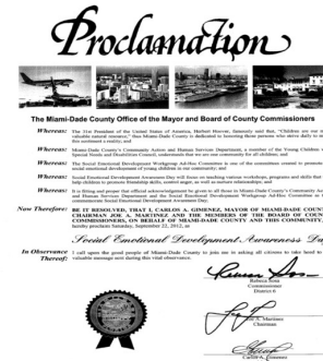
Lower left: City of Miami Proclamation: Proclaiming Saturday, 22, 2012 as Social Emotion Development Awareness Day