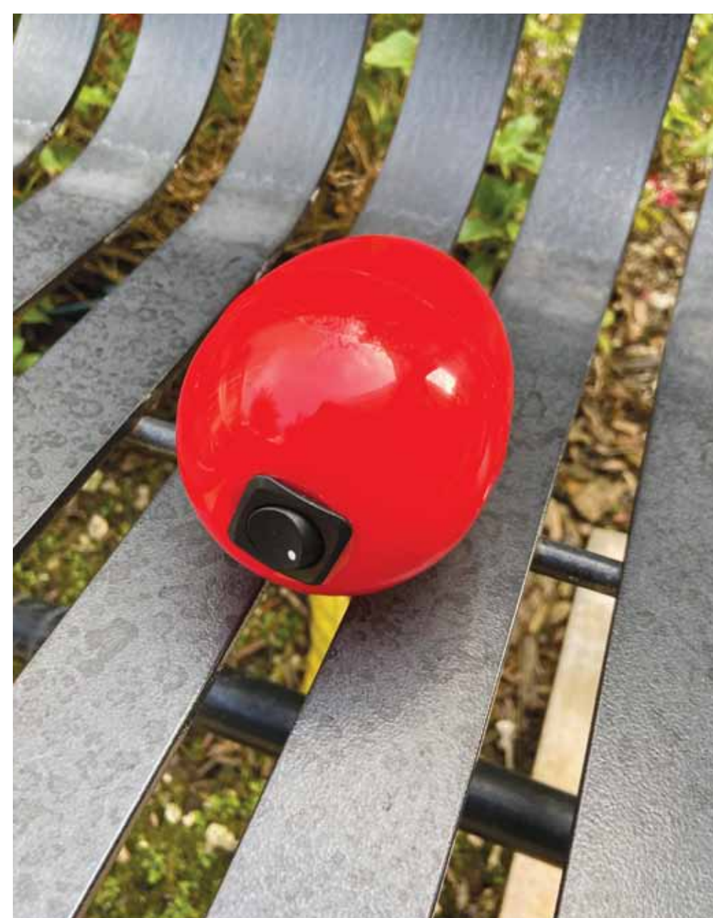
An egg that beeps.